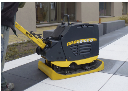
No breakage of paving stones